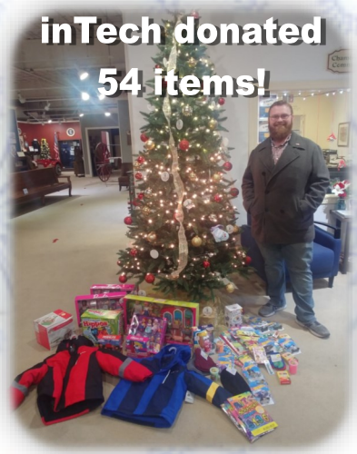
inTech donated 54 items!