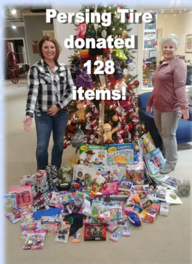
Persing Tire donated 128 items!