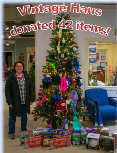
Vintage Haus donated 42 items!