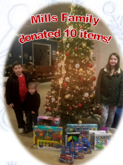
Mills Family donated 10 items!