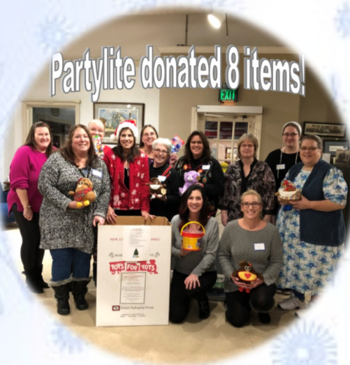
Partylite donated 8 items!