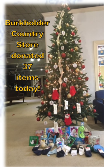
Burkholder Country Store donated 37 items today!